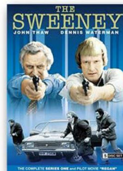
THE SWEENEY 1975 10 MINUTE EXTRACT

How to use: Compare and contrast these crime dramas. Use this Knowledge Organiser to identify the similarities and differences between the two products.