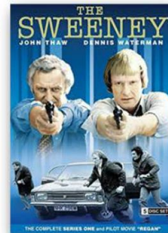
THE SWEENEY 1975 10 MINUTE EXTRACT

How to use: Compare and contrast these crime dramas. Use this Knowledge Organiser to identify the similarities and differences between the two products.